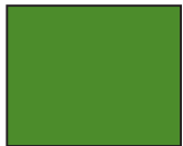
Pantone #363 Publix Green

The colors shown below should be cross-referenced with primary sign material colors: pre-finished returns, translucent vinyls and pigmented acrylic, for example. The Hunter Green and Navy Blue are not approved for translucent use. Letter faces in these colors will be white at night.